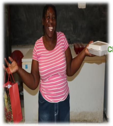
CHRISTMAS DAY DINNERS