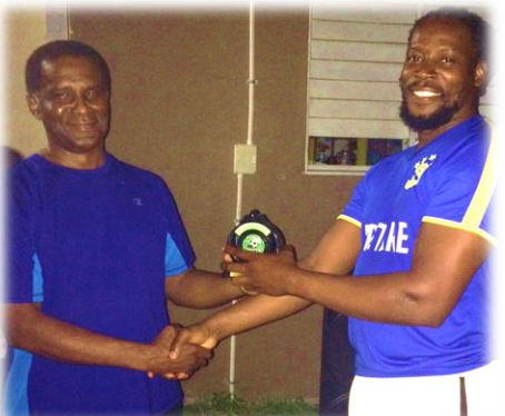
FOOTBALL TOURNAMENT FOR THE OLDSTERS, CURRENT AND UPCOMING BALLERS